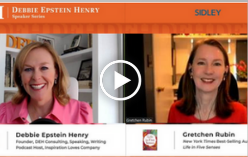
Life in Five Senses with Gretchen Rubin