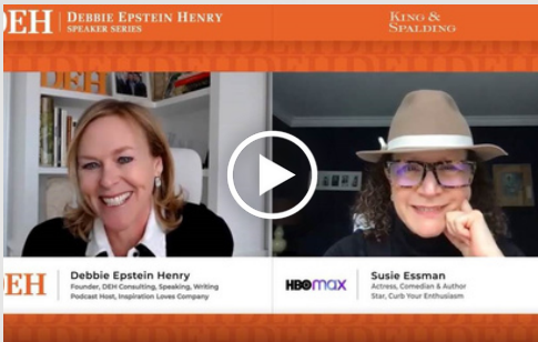
Women & Comedy with Susie Essman